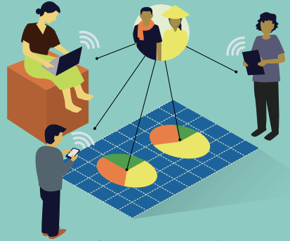
Offering a gender data repository