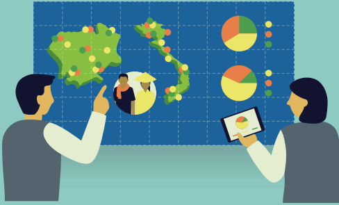
Visualizing and mapping gender data